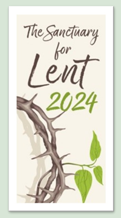
Pick up a Lent Devotional Sunday, February 11th, in the Sanctuary or in the church office. All families are welcome to take a copy to share.

Come and join us for one or both services on Valentine's, and discover the deepest love of all from God!