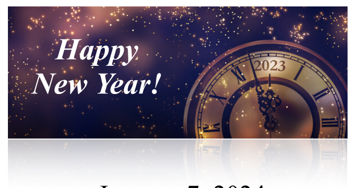
January 7, 2024 Epiphany Worship Service with Communion Sanctuary & Online 10:00 AM