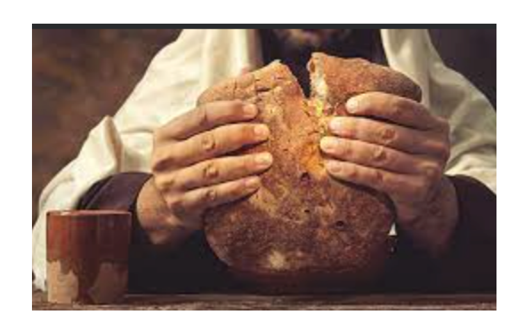
"Bread of Life" Matthew 2:1-12