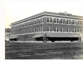
The building was originally the Long-Bell Commissary.

( 121 S. Washington Street ) In 1904, the Long-Bell Lumber Company of Kansas City, Missouri, established a large mill within sight of the central business district. It became the town's largest employer. The Hudson River Lumber Company was a subsidiary of Long-Bell. The company built a wood-frame commissary first, yet around 1917, it was replaced by a brick building.