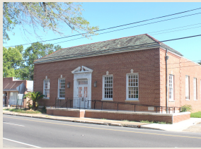
The building today.

The post office, across from the courthouse and jail, was built in 1935. The brick Colonial Revival is home to the Beauregard Tourist Commission, Lois Loftin Doll Collection and a mural painted by noted artist Conrad Albrizio.