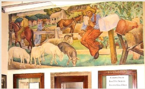
"Rural Free Delivery"