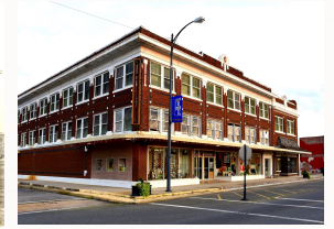
The Standard Building is now the Treasure City Mall.