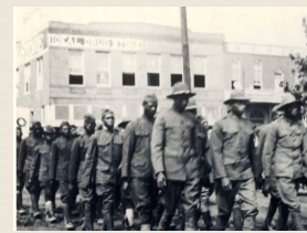
WWI soldiers marching in front of the building.

(103 N. Washington St.) This building housed Ideal Drugs for years, yet before that, it was the People's Supply, an early mercantile. The Jouban family operated their store in the building starting in 1923 and in various forms, it was a mainstay for decades.