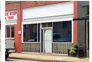
The building today.