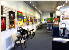
"RealArt" DeRidder takes its name from an old DeRidder movie theater.

The RealArt DeRidder Gallery building is owned by the city, but it is a collaboration of the community. Volunteers staff this wonderful, little gallery which features the works of local and regional artists.