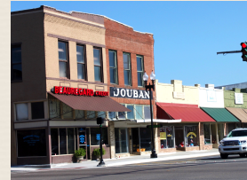
The building today.