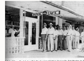
An early 1950s scene at the Royal Cafe.