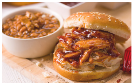
Don't forget to join us after service in the gym for pulled pork sandwiches, beans, potato salad, a drink, and dessert. All donations go directly to adding sun coverage at both the MCLC & Wesley Education Center play areas. Thank you!