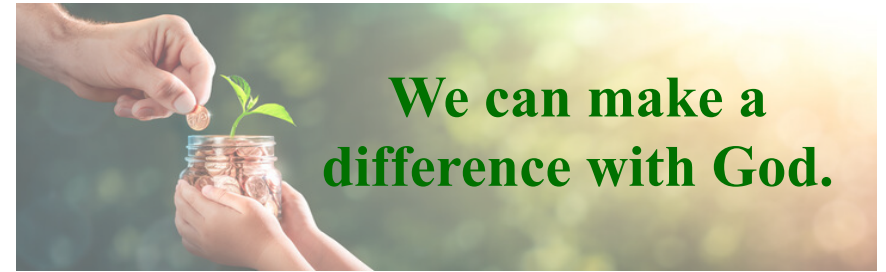
Examples of Various Levels of Estimates of Giving