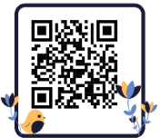
Scan QR code and open link to hear children sing

Please join us every Wednesday at 4:45 in the choir room. The children will sing on Sunday, April 19